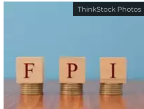
An FPI, registered with Sebi, has to renew its licence every three years by paying a little less than $3,000.

The government, in a notification issued on Wednesday, said that offshore funds will have to inform their custodians within seven working days of any 'direct or indirect change' in their control, ownership, and structure.